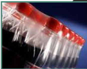
LD Shrink Film

Food products : Mineral water, Soft drinks, Beverage, Pickles, Jams, Jellies, Fruit juices, Tea, Coffee, Spices, Ghee, Edible oils, Bottles/can/packages. Cosmetics : Soap, Powder, Perfumes, Hair oils etc. Consumer Products : Tissue paper boxes, Computer CD's, Stationary Toys, Greeting Cards etc. Others : Pharmaceuticals, Coir industries, Auto mobile parts, Welding electrodes etc.