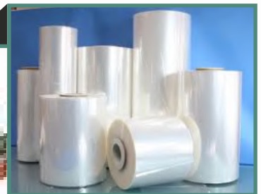
PVC Shrink Films