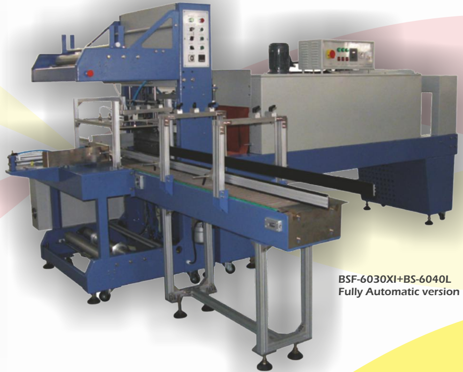
BSF-6030XI+BS-6040L Fully Automatic version